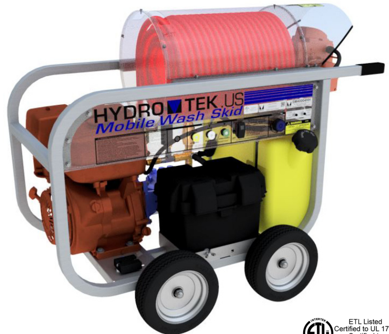
Shown with optional stainless steel frame